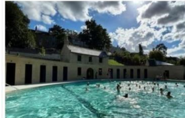
► Cleveland Pools in Bath. Built in 1815, the lido is the UK's oldest outdoor pool and will reopen fully this year.

Renaissance for open-air swimming as communities restore derelict sites and campaign for new pools